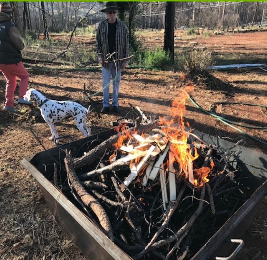
Top-lighting Oregon kiln with kindling