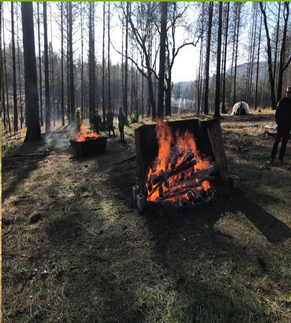
Shielded kiln burning