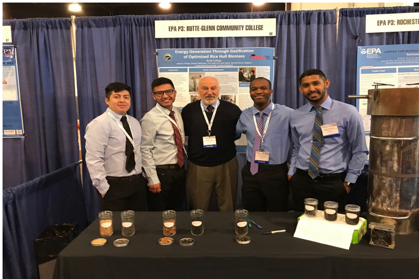
EPA-P3 National Exhibit in WDC Phase II Grant Award