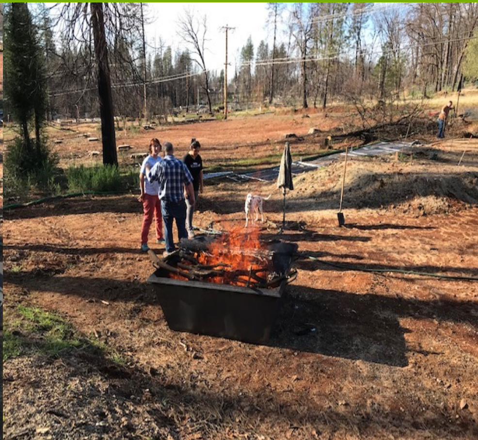
Oregon kiln burning with no smoke