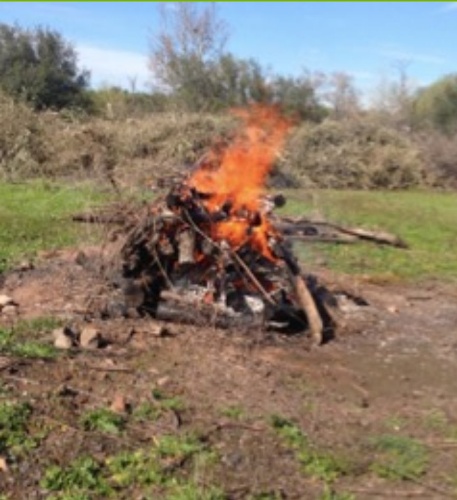
CONSERVATION PILE BURN