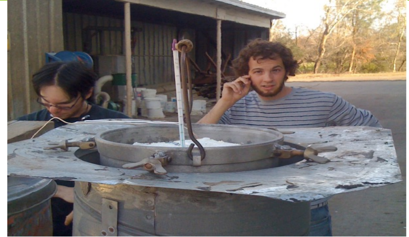
Thermal Energy Measurements