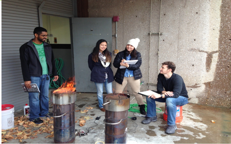
Biomass Pyrolysis = Biochar