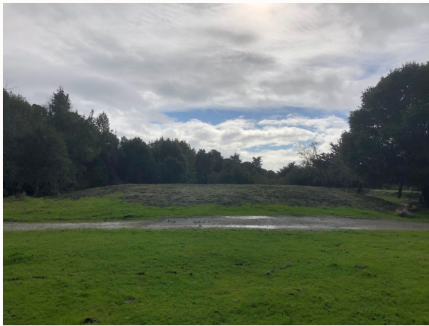
Wildcat Canyon Landslide Spoils Restoration