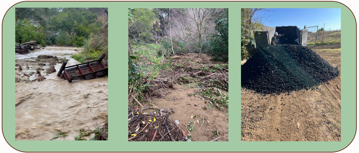
Dry Creek Ranch Storm Damage Soil Restoration

EBRPD Is Utilizing Biochar Produced from Hazardous Fuels Reductions Projects for Multiple Beneficial Uses