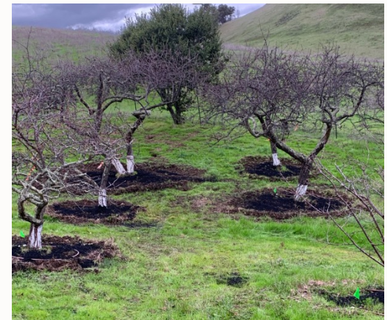
Garin Ranch Apple Orchard

EBRPD Is Utilizing Biochar Produced from Hazardous Fuels Reductions Projects for Multiple Beneficial Uses