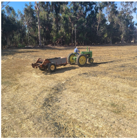
Crop Planting at Ardenwood Farms