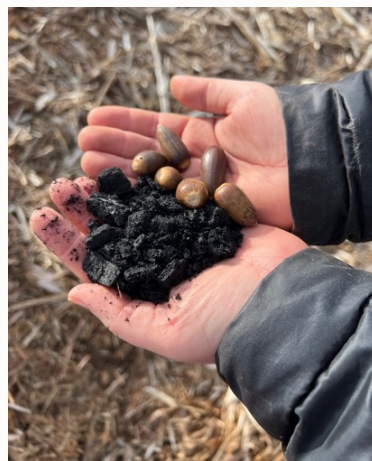
Native Oak Replanting (Scenic Fire Site)