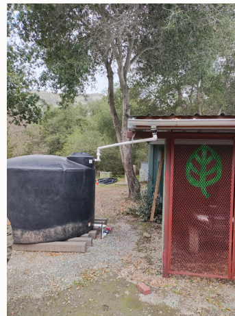
Rooftop Runoff Filtration