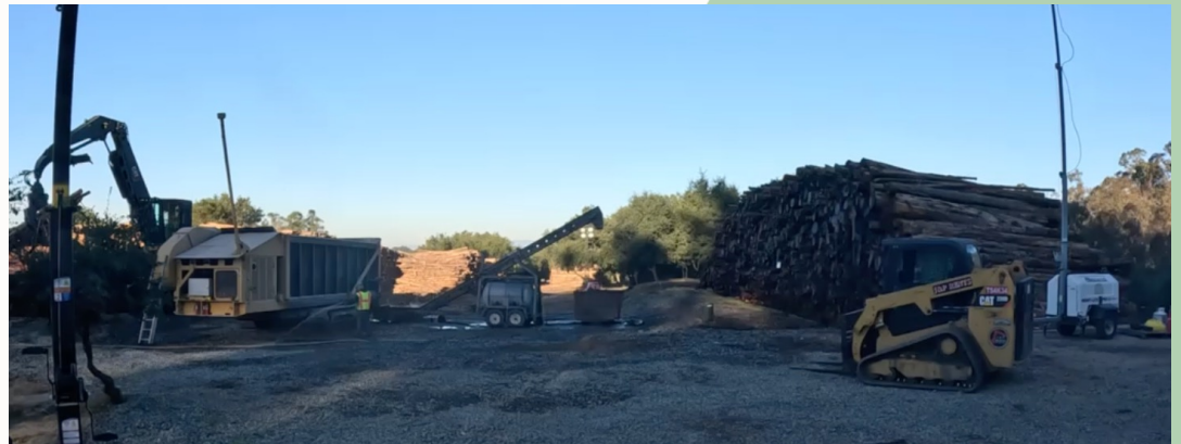
Biochar Processing Site

Reducing Carbon Footprint While Turning Waste into Value