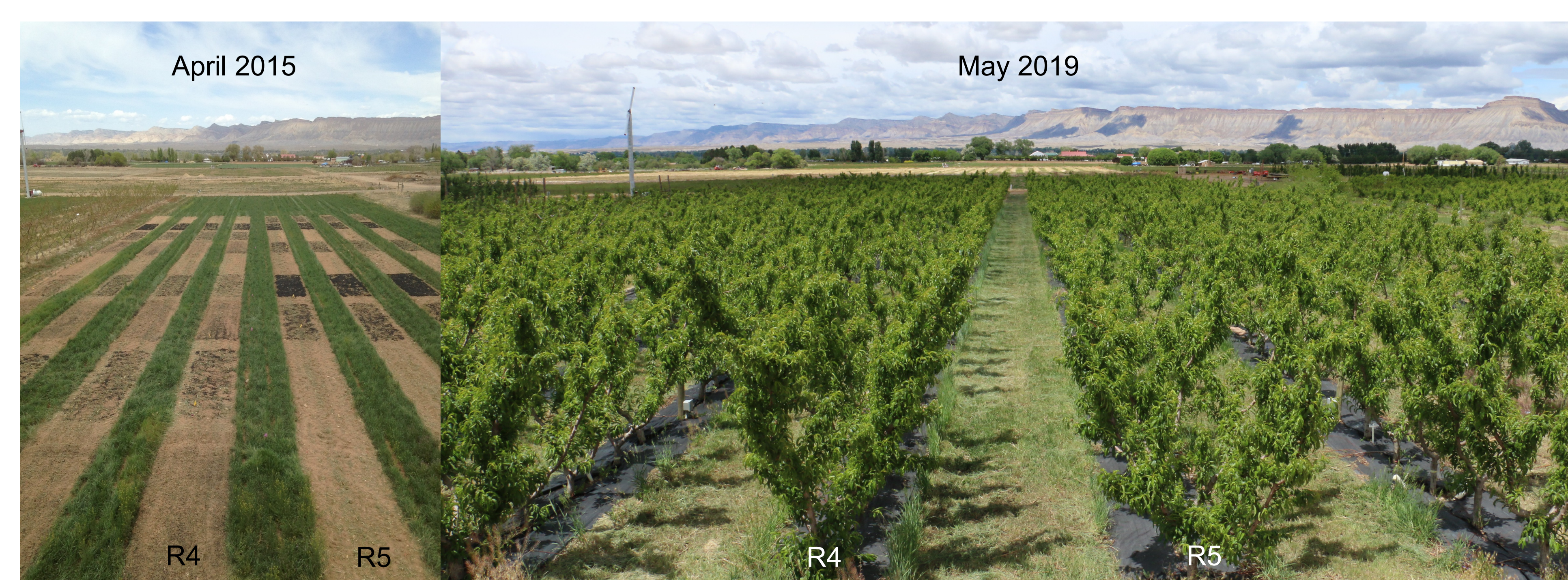
Figure 1. The peach orchard in WCRC-OM, Grand Junction CO, before planting in 2015, where the distribution of the replicated blocks of the different biochar rates are shown (left), and the appearance of the 5 th leaf 'Suncrest' peach trees (May 2019, right). R4 and R5 are abbreviations of row 4 and 5.