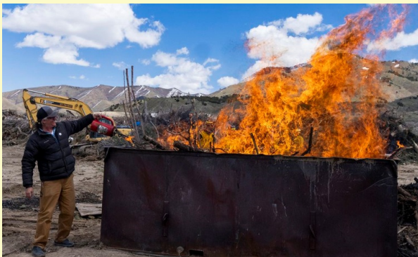
Big Box Biochar system

Your state solid waste management department may not know about biochar and wood ash from mobile carbonizers. USBI has helped these agencies learn about biochar's beneficial uses.