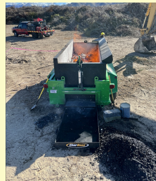
CharBoss by AirBurners Inc. in action