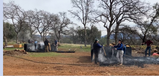
Butte County demo in California »

► Fire Safe Council and Volunteers Demo Biochar in Northern California The Butte County Fire Safe Council and volunteers joined forces to demonstrate the positive effects of biochar via the Biochar Demonstration and Fuels Reduction Work Day in Paradise for the mission of protecting our natural resources such as forests.