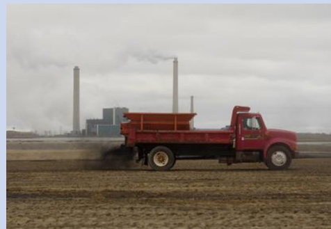
Spreading biochar on ash landfill. »

► Minnesota Poised to Become Biochar Leader Using Abundant Balsam Fir Resource In partnership with energy provider Minnesota Power, the Natural Resources Research Institute is applying charred balsam fir to a capped coal ash landfill at the Boswell Energy Center in Cohasset, Minn. The goal is to improve the soil so that native grasses can revegetate this space for new uses.