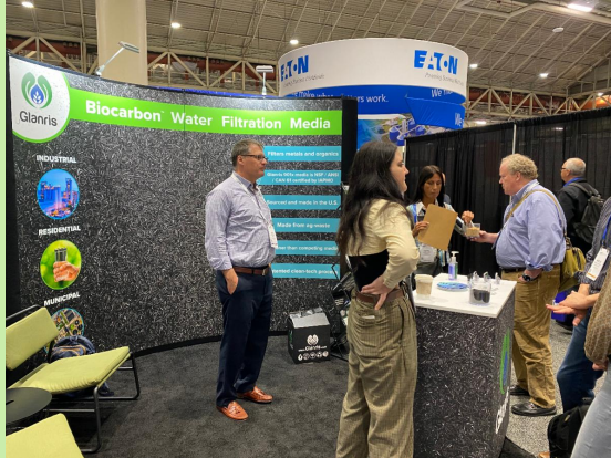
Glanris exhibits biochar-based filtration products at WEFTEC.

Biochar companies interested in participating in a North American Pavilion at the Bio360 conference in Nantes, France should contact Paul Stuart by October 28.