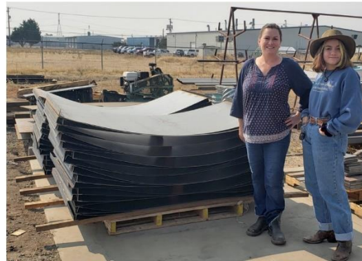
Made in the USA. Manufactured in Jackson County, Oregon